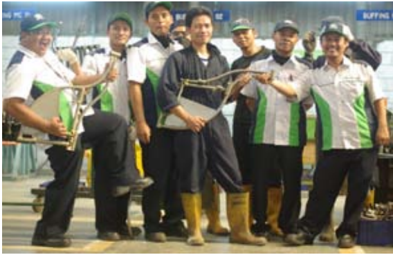
Workers in Jakarta take a break from building RoughRiders

The PT Dharma wheelchair factory in Jakarta, Indonesia, which already manufactures over 100,000 standard wheelchairs per year, is now manufacturing 50 RoughRiders® per day, with an expected increase to 100 per day within six months. This level of manufacturing is unprecedented for Whirlwind. Only a few years ago our best shops produced at most 250 wheelchairs per month. The big